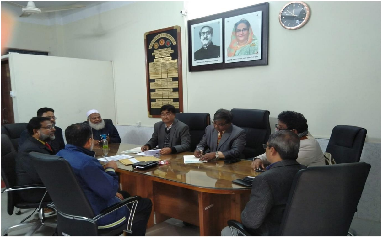
চুক্তি স্বাক্ষর অনুষ্ঠানের চিত্র