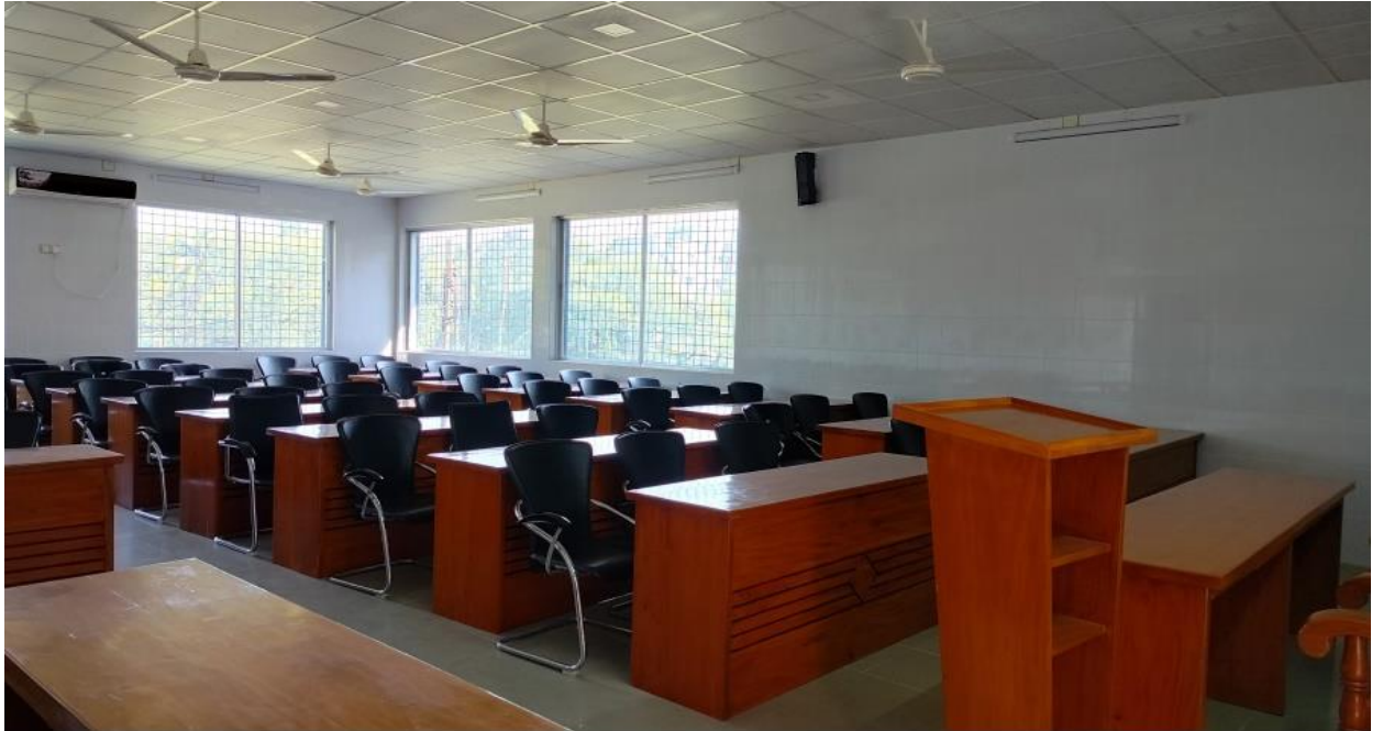
কম্পিউটার ল্যাব কাম কনফারেন্স রুম