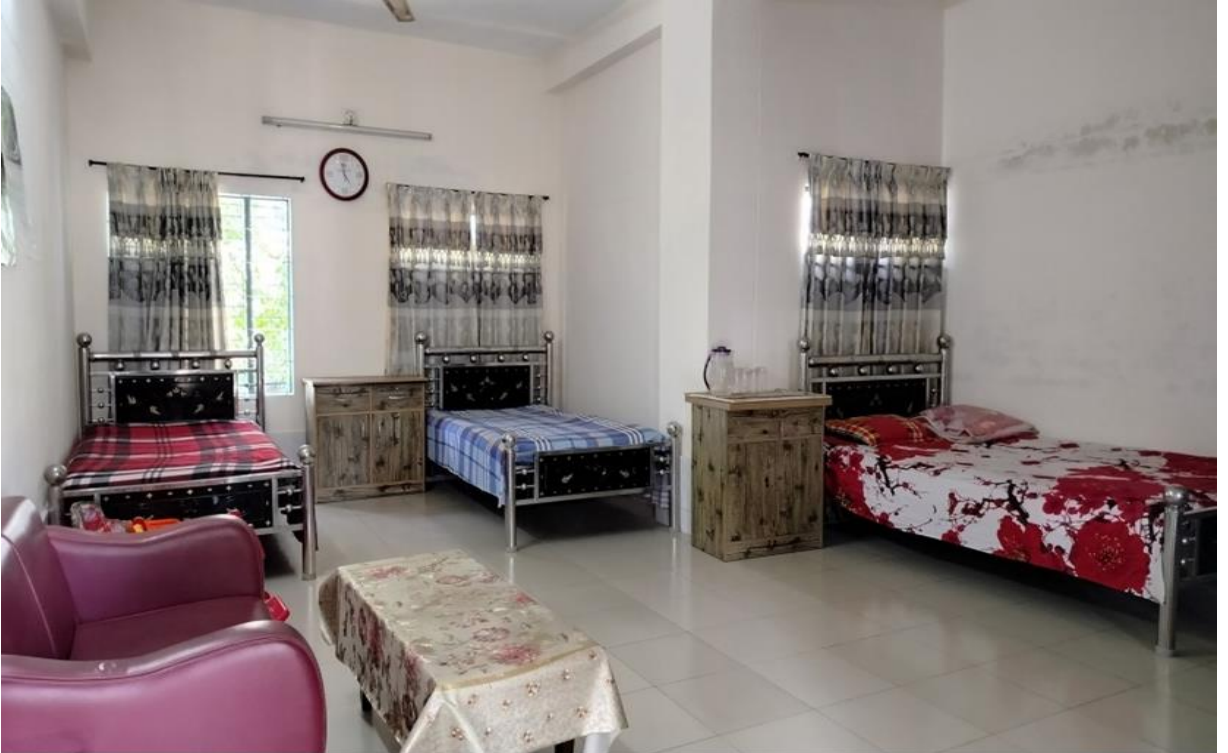
লেডি অফিসার্স রিফ্রেশমেন্ট এন্ড চাইল্ড কেয়ার জোন