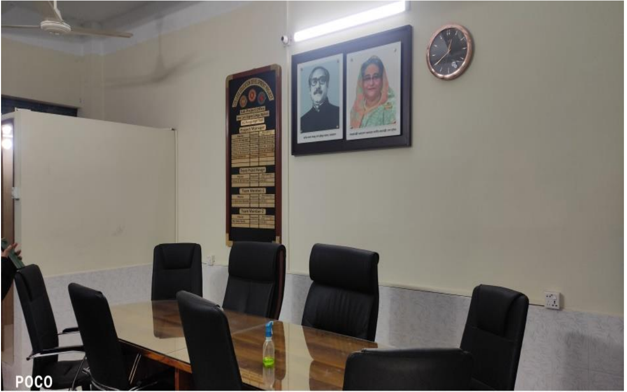
সিইডিপি সাব-প্রোজেক্ট অফিস, নিউ গভঃ ডিগ্রী কলেজ, রাজশাহী