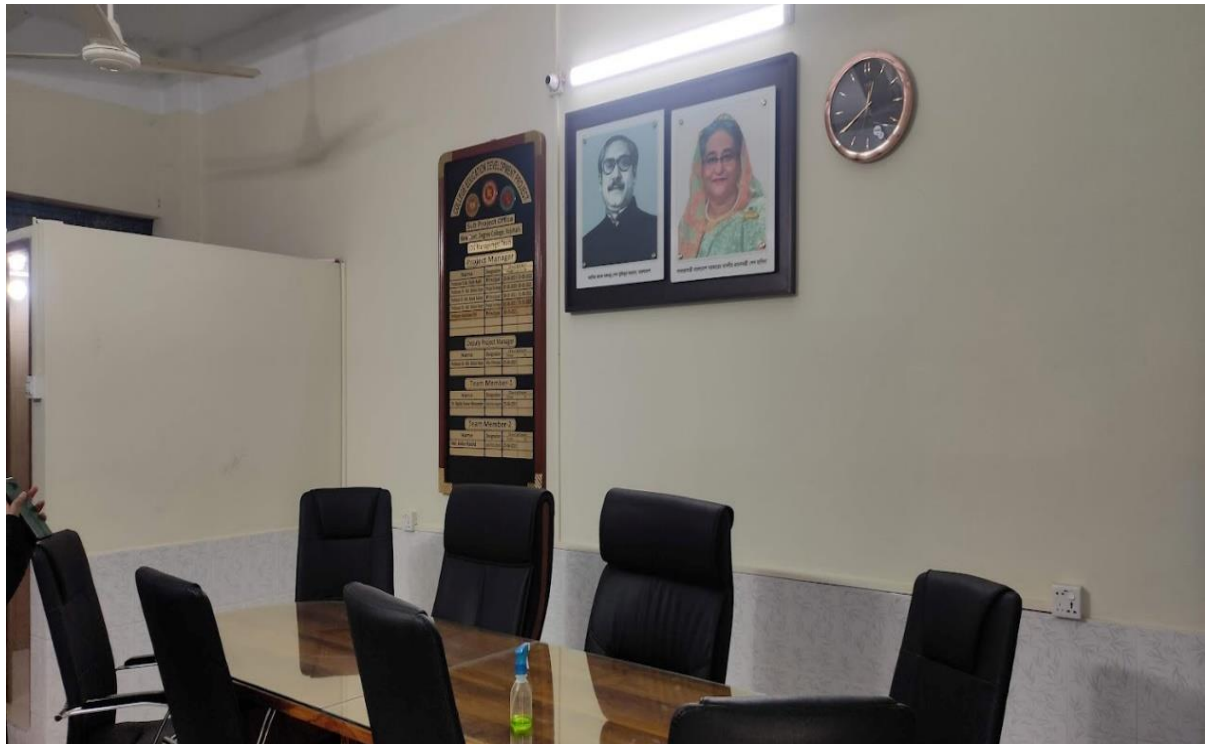
সিইডিপি সাব প্রজেক্ট অফিস