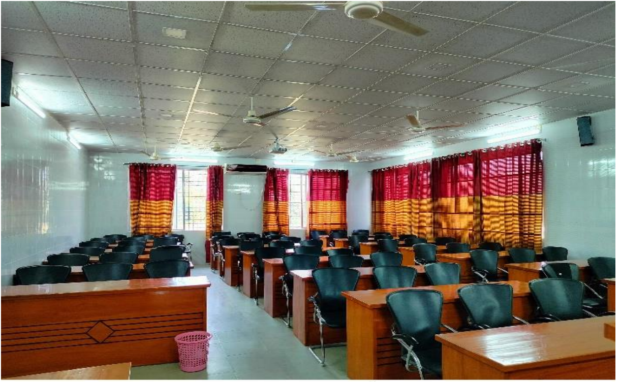
কম্পিউটার ল্যাব কাম টিচার্স কন্ফারেন্স রুম