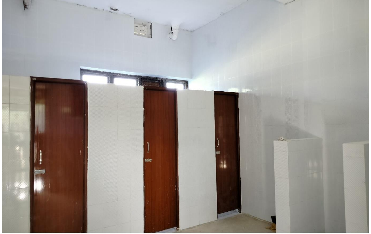
ছাত্র ওয়াশরুম - ১