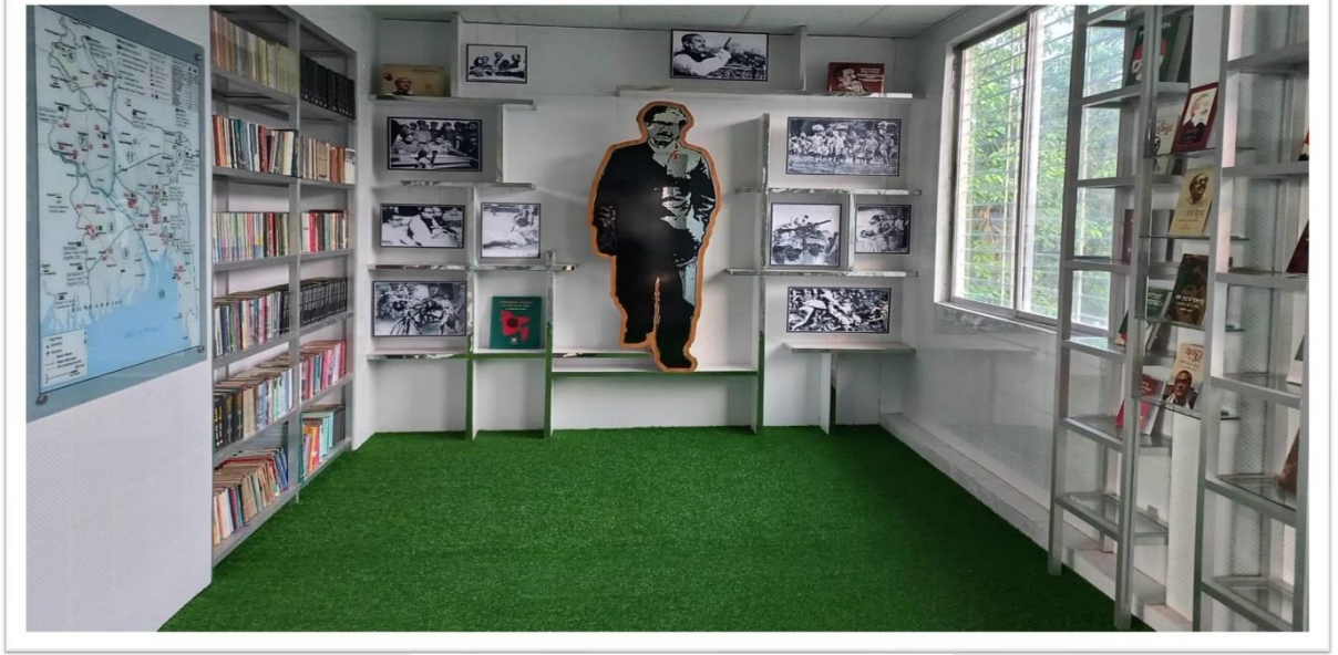
বঙ্গবন্ধু ও মুক্তিযুদ্ধ কর্নার