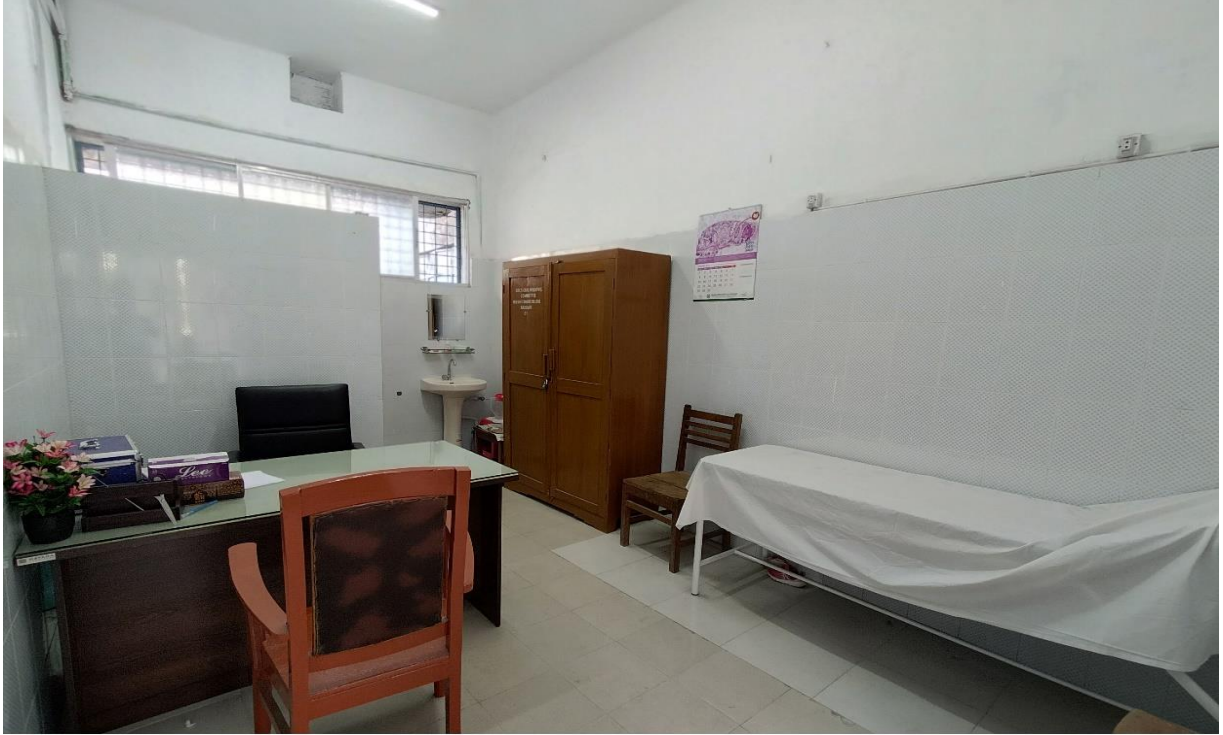
মেডিকেল অ্যান্ড কাউন্সেলিং সেন্টার