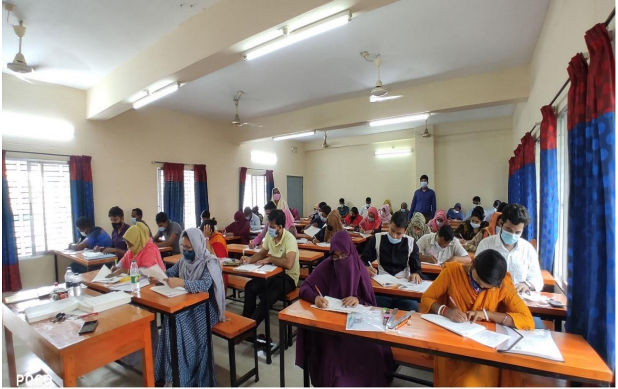
ক্লাস রুম, রাষ্ট্রবিজ্ঞান, নিউ গভঃ ডিগ্রী কলেজ, রাজশাহী