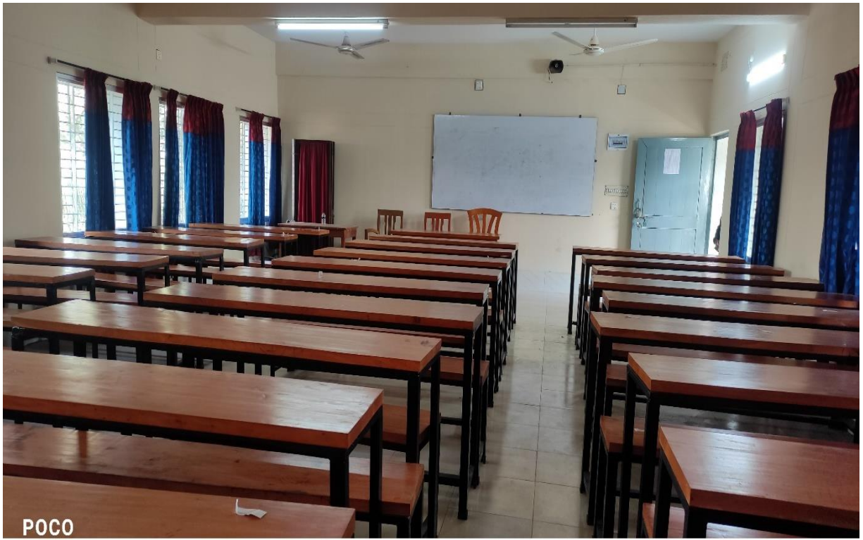
ক্লাস রুম, রাষ্ট্রবিজ্ঞান, নিউ গভঃ ডিগ্রী কলেজ, রাজশাহী